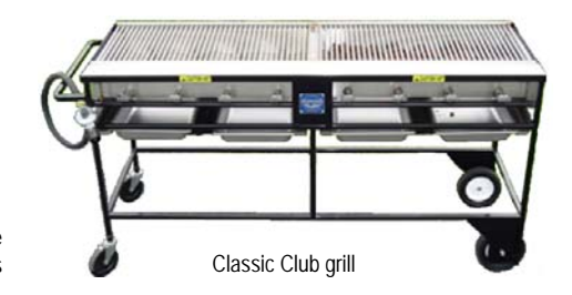
Classic Cookers Made in U.S.A. Innovative, rugged cookers, grills & griddles that stand up to years of service.