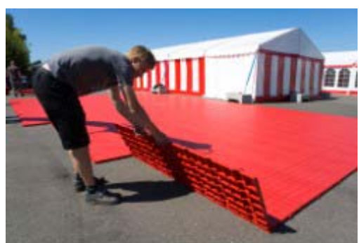
IkaFloor is available in a variety of colors & patterns. All are UV-stable for years of dependable service

IkaFloor: The durable, lightweight alternative to heavy wood or plastic flooring.